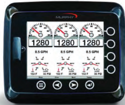
HelmView™ Large VGA Color Display

"Creating the display has certainly been a team effort. Murphy worked with us every step of the way to ensure that the display matched our customers' high expectations. They went above and beyond by providing us with technical, engineering and sales support on location at our office."