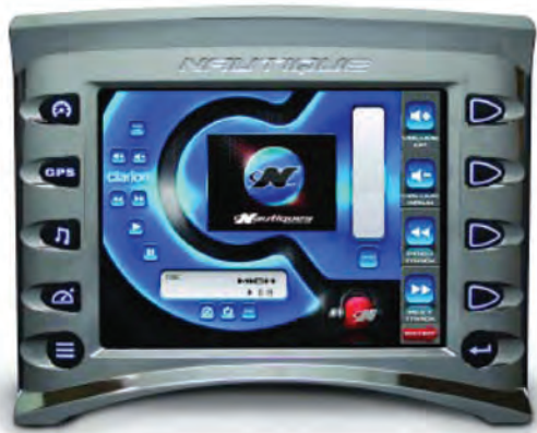
HelmView™ Color Display & customed Bezel

Full Integration – Mix it. Merge it. Make it Your Own.