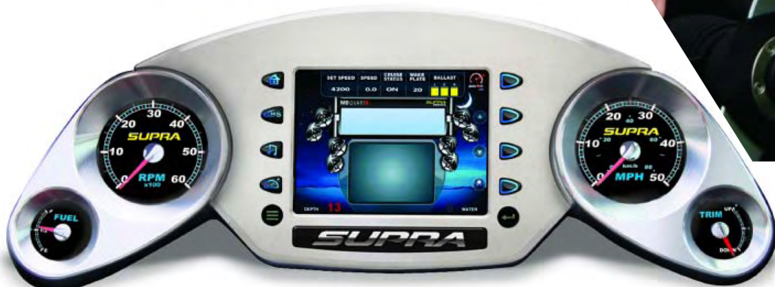
HelmView™ Color Display & customed Bezel