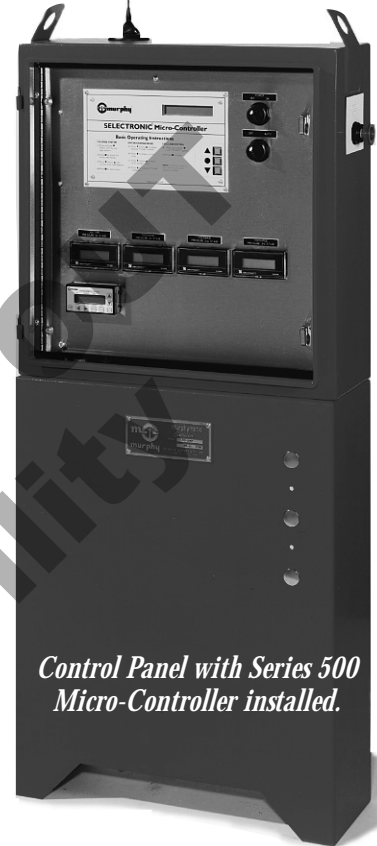
Control Panel with Series 500 Micro-Controller installed.

The Series 500 controller is not limited to these applications. It is designed to accommodate the most demanding automation needs. The Series 500 controller is applicable in situations requiring many inputs and/or outputs and where very precise set points and timing periods are required. It is especially useful when easy customer interface is desirable.